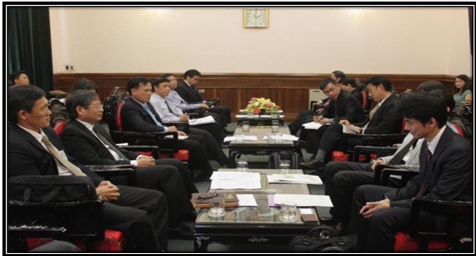
The meeting preparing for Urban Development Forum Tripartite Cooperation on Sustainable Development of Da Nang City (March, 2014)