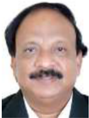
Swayandipta Pal Chaudhuri

I am Serving as member of Legislative Assembly, Karnataka State from past 30 years. In this capacity I have been state rank as well as cabinet rank minister previously in government of Karnataka. I am presently cabinet rant minister for urban development & haj in the present government. As a policy maker, have initiated majors such that all the six cities of Karnataka are enlisted in the ambitious smart city project initiated by government of India. We are now at the stage of designing in the implementation plan for smart cities.