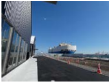
Continuous berth that extends over 1,000m.