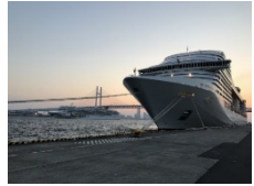
Deep water depth near the Yokohama navigation channel.