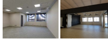
Room1 Multi-purpose space

Location : Daikokufuto, Tsurumi-ku, Yokohama Number of floors : One floor above ground and three buildings; steel construction Total area : Approx. 5,000㎡ Main facility : Two CIQ buildings; approx. 1,500㎡ Waiting hall; approx. 1,500㎡