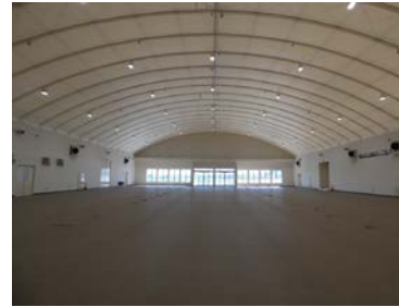
Large space without pillars