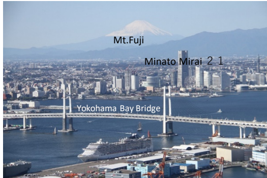
Scenery that can be enjoyed by cruise passengers.