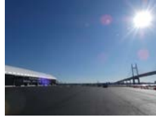
Huge space for operation and parking (approximately 20 ha)